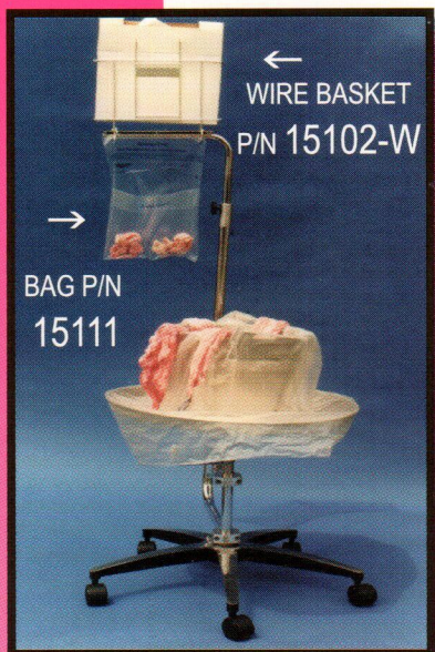
SYSTEM I Single Bag