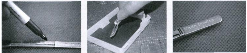
Reusable Saf-T Scalpel (Side Activation)

Advanced Medical Innovations Mission Industrial Park 8741 Shirley Ave, Northridge, CA 91324 Tel: 1-818-701-7180 Fax: 1-818-701-9708 E-mail: sales@amiwelisten.com Website: www.amiwelisten.com